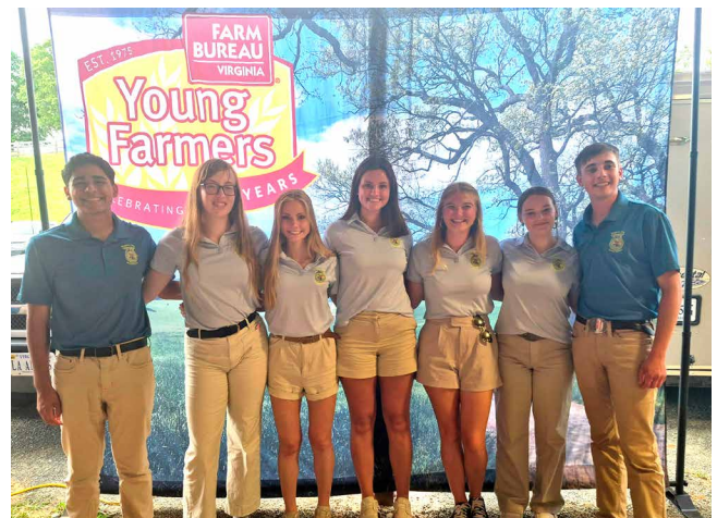
The State Officers posing at the Awards Banquet.