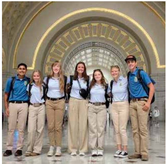
The VA FFA State Officers arriving at Union Station.

During these visits, we emphasized the importance of agriculture by highlighting everything it has done for us personally and professionally. Our discussions were rooted in the impact agriculture has on communities, the economy, and the environment. This advocacy allowed us to leave a lasting impression on our representatives while reinforcing the significance of FFA's role in shaping future leaders and agricultural innovation.