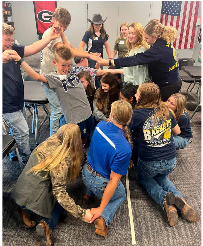
Members of all ages from the South Ridge Area attempt the human knot challenge during the Team Conflict workshop.

By the end of the event, members walked away with more than just new skills—they gained a deeper understanding of what FFA truly represents. Through activities and meaningful