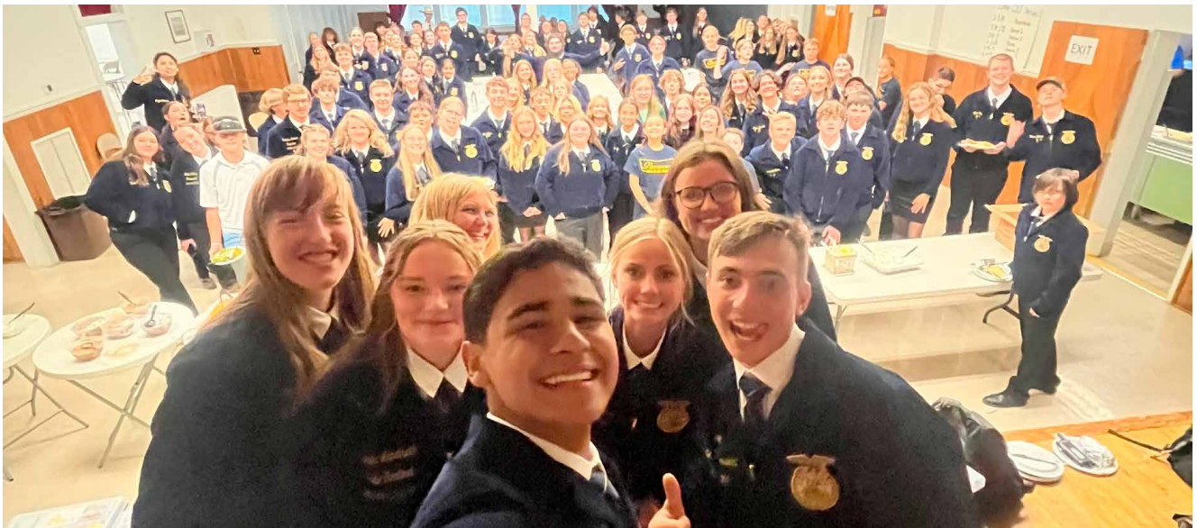
After a long evening of workshops, the state officer team takes a selfie with the Central Area members.

reflections, participants discovered that FFA is not just for “agriculture kids,” but rather a place where anyone can find opportunities to grow as a leader. Area COLTS continues to be a powerful experience that shapes future leaders and inspires members to make a lasting impact in their chapters, schools, and communities.