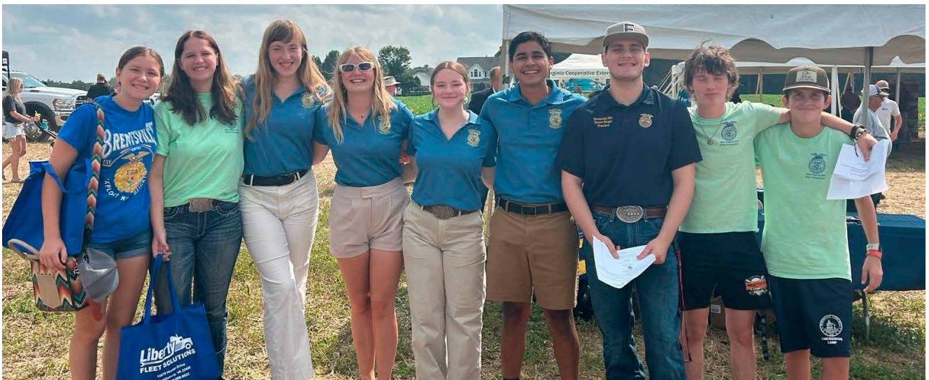
Students from the Brentsville FFA chapter.