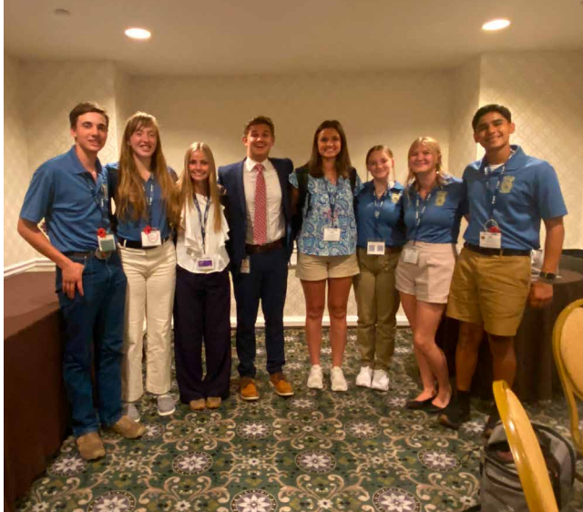
The State Officers meeting with a Senator Tim Kaine representative to discuss the FFA Caucus.

Beyond the professional and educational experiences, the summit was a personal journey of connection and growth. We bonded not only with other state officers but also with national officers, discovering common ground through our shared passion for agriculture and leadership. These relationships were strengthened by the appreciation of each individual's unique contributions to their communities and FFA chapters. As the summit concluded, we left inspired, having made an impact on others while establishing a legacy of dedication and camaraderie that will continue to influence the future of FFA.