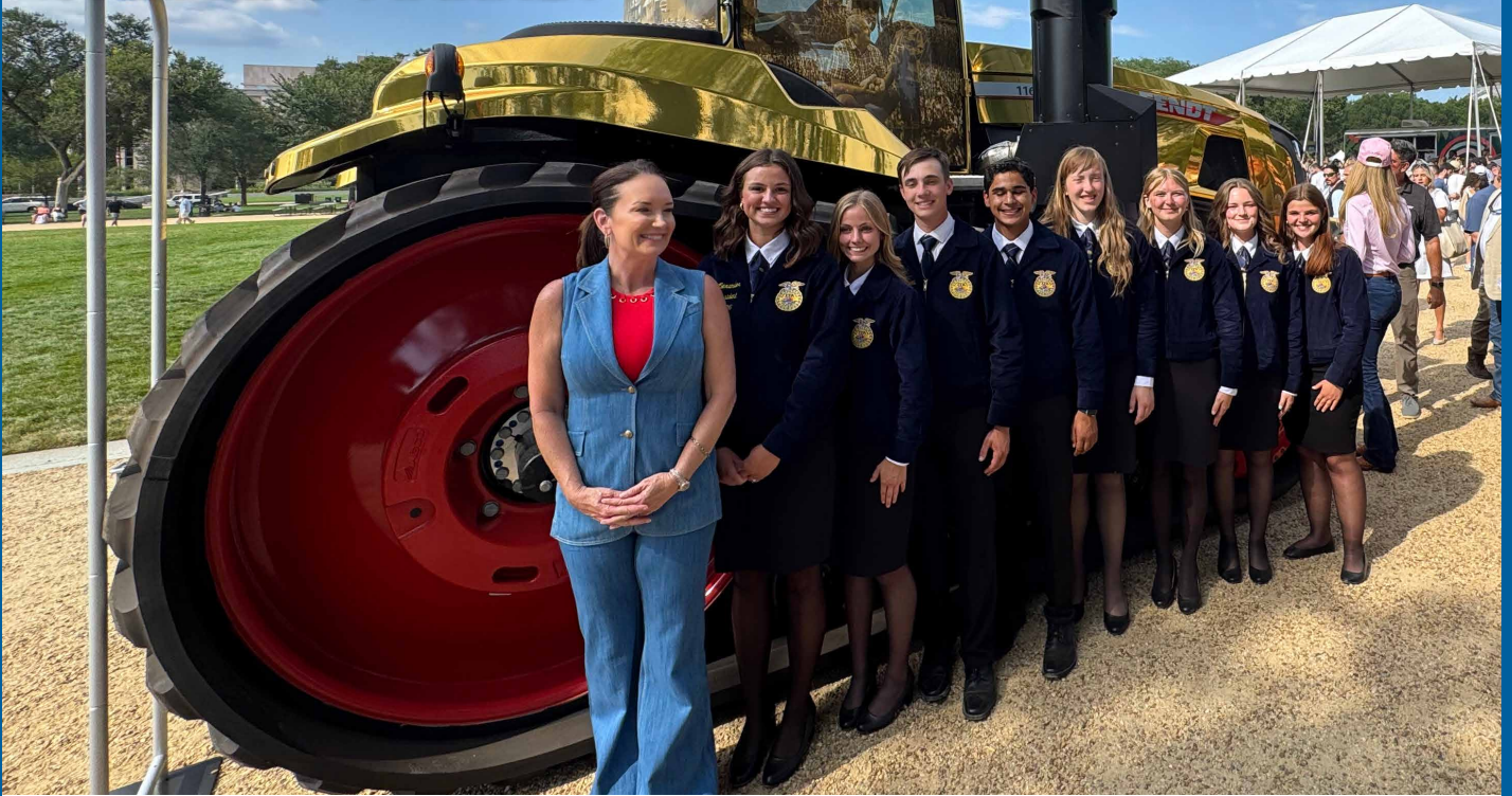
The 2025-2026 Virginia FFA State Officer Team smiles with Secretary of Agriculture Brooke Rollins in front of a gold FENDT tractor.