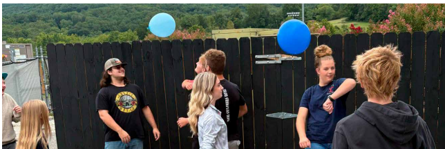
Students in ag classes at Lord Botetourt High School participated in a teamwork game where they had to work with their group to keep the balloon in the air.

The workshops the State Officers deliver also provide a break from the normal routine for students. Whether the visit is during a class or during an after-school meeting, the State Officers strive to teach the FFA knowledge and leadership skills through fun activities. Whether that be through an Official Dress style dress up game or a teamwork game that involves keeping a balloon in the air for as long as possible with a group of members, these fun and unique activities make the workshops special and memorable for the students