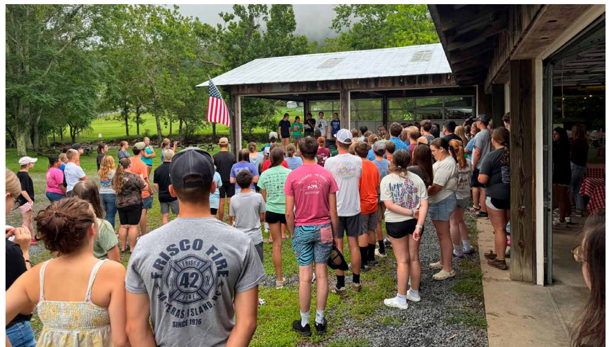
Before breakfast every day, a group of campers would volunteer to assist in the Raising of the Flag ceremony, where they would each read a paragraph about the history of our nation to start the day off strong.