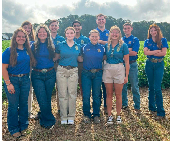
Orange County School FFA Officers.

A highlight of the day was the opportunity to meet and speak with Representative Vindman, further emphasizing the importance of agricultural advocacy and leadership.