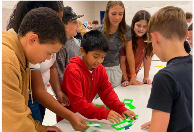
Students from Caroline Middle School participated in a history date match-up with some of the important dates in FFA. This competition motivated the students to pay attention and work together to get the dates correct.