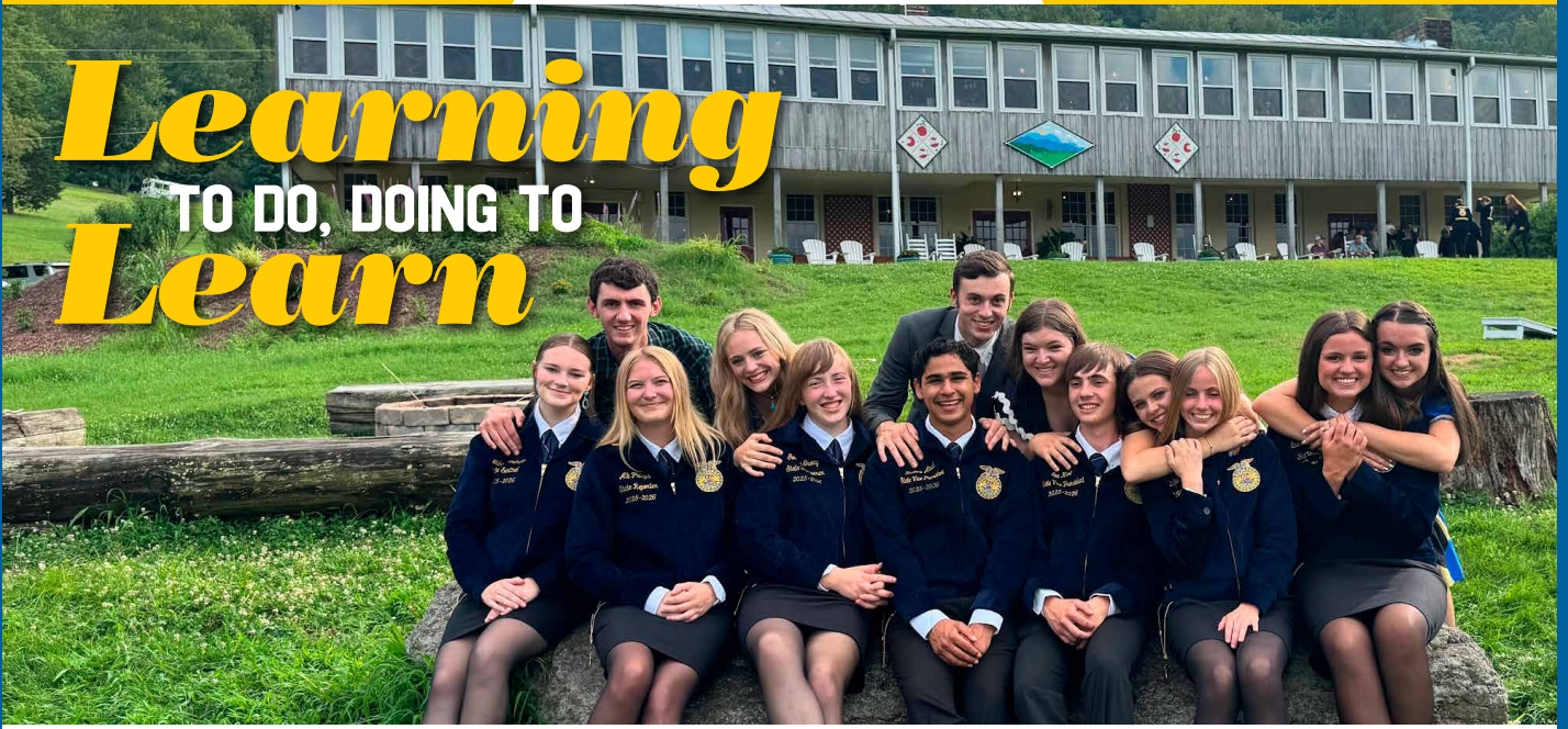
The first time the past state officers aren't wearing official dress happens during camp pictures with the new team- and it can be an emotional moment.

by Georgia Grady – VA FFA 2025-2026 State Treasurer