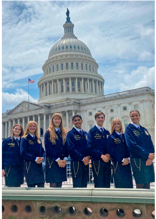
The VA FFA State Officers outside of the U.S. Capitol going to speak with representatives about the FFA Caucus.