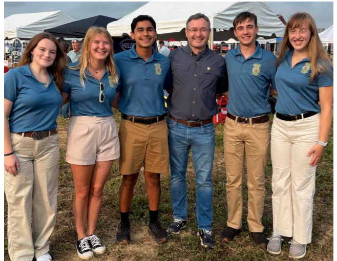
State Officers with Representative Vindman.