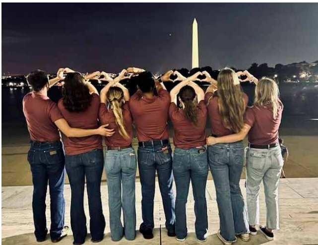
The VA FFA State Officers connecting with others under monuments.

A highlight of the summit was the chance to meet with our representatives from various regions of the country.