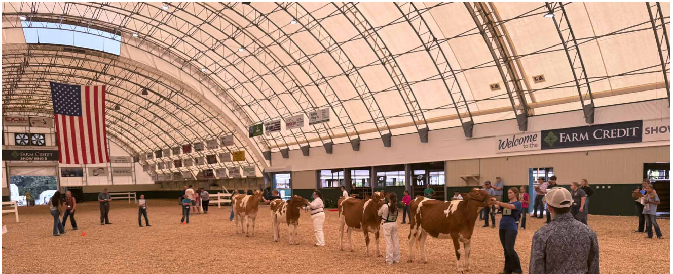
Participants judging red and white dairy heifers.