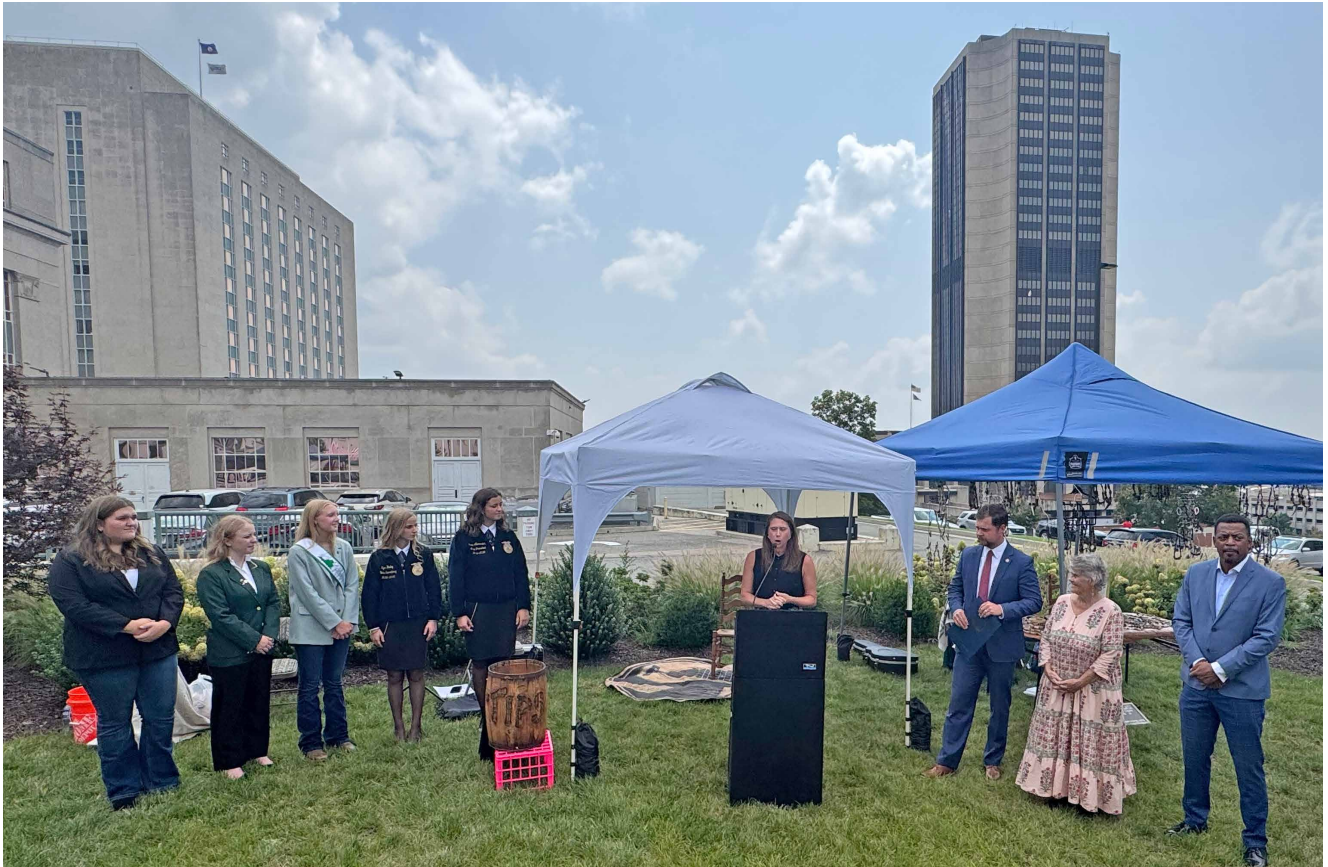
Having every contributor of the Farmers market be recognized with a speech.

advocates for agriculture. This event stands out as a cherished memory that fuels our passion and commitment to serving the farming community. We are excited for future opportunities to support and collaborate with agricultural businesses across the state, continuing our mission to lead, serve, and grow alongside Virginia's agricultural future.