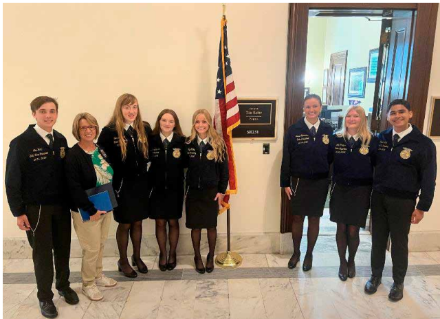
The State Officers outside Senator Tim Kaine's office meeting with a Texas representative to practice discussing the FFA caucus.