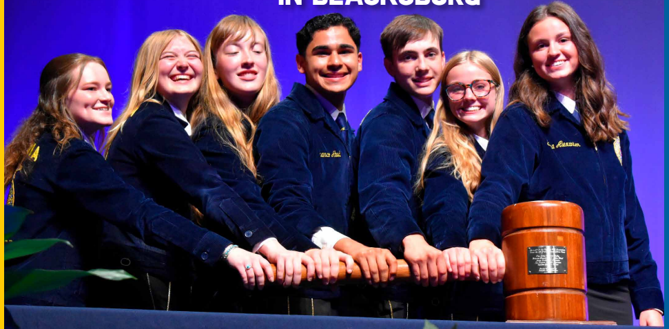
The newly elected 2025-2026 VA FFA State Officer team closing final session.