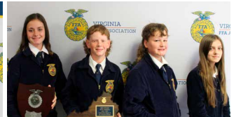
AGRONOMY - JUNIOR Team: Charlotte Central Middle