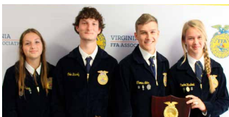
ENVIRONMENTAL AND NATURAL RESOURCES Team: Broadway