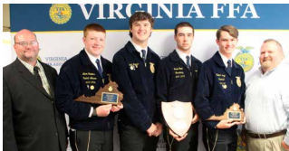
AG SALES Team: Randolph-Henry