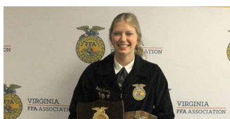
STAR SENIOR CHAPTER Team: Central