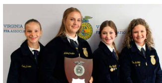
HIPPOLOGY - JUNIOR Team: Fort Defiance