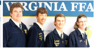
AG MECHANICS - SENIOR Team: Randolph-Henry