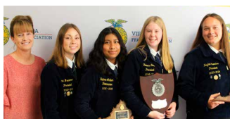
MILK QUALITY AND PRODUCTS Team: Sherando