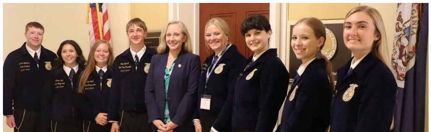
Smiling for a picture, the 2023-2024 State Officer Team visits with Congresswoman Abigail Spanberger.

The National State Officers Summit was the gathering of FFA State officers from all 50 states and Puerto Rico. It was a great showing with representatives from almost every state. It allowed us to see how agriculture is accomplished throughout our country. Giving everyone a new perspective on innovation and adversity and how to implement and overcome both. We not only were able to increase our understanding of agriculture on a larger scale but made amazing friends and connections who will most definitely be a resource we use now and in the future.