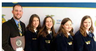
HORSE EVALUATION - JUNIOR Team: Wilson Middle