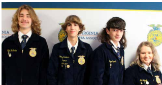
AGRONOMY - SENIOR Team: Appomattox