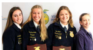
HORSE EVALUATION - SENIOR Team: Riner