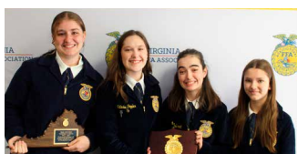
VETERINARY SCIENCE Team: Eastern View

ORDER YOUR OWN VIRGINIA FFA LICENSE PLATE AT SUPPORTFFA.ORG