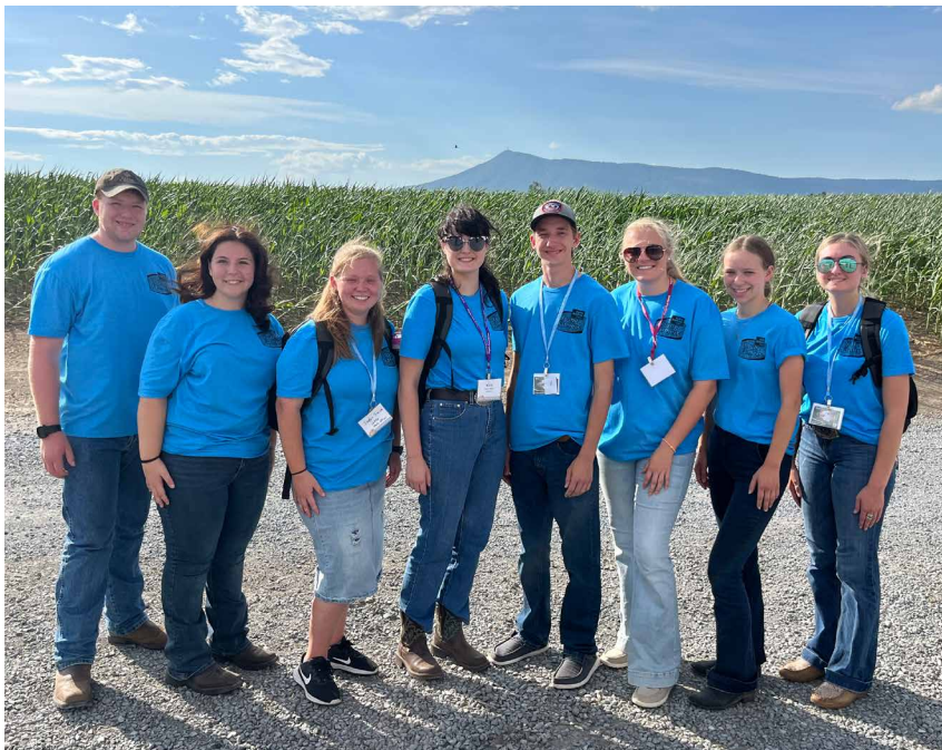
A team picture at the final stop on the farm tours... a huge dairy farm!