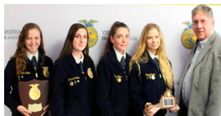
LIVESTOCK JUDGING - SENIOR Team: Massanutten Technical Center