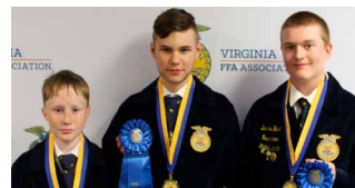
MIDDLE SCHOOL FOOD AND FIBER Team: RE Aylor