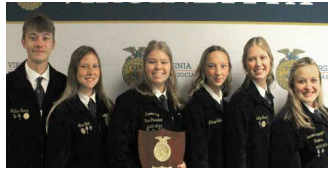
AG ISSUES Team: Central