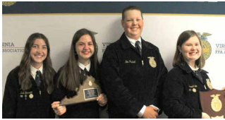
AG COMMUNICATIONS Team: Abingdon