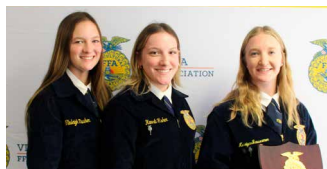
MARKETING PLAN Team: Strasburg