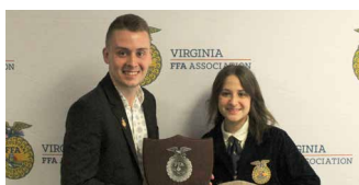
STAR JUNIOR CHAPTER Team: Signal Knob