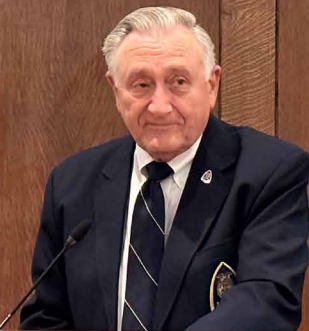
THE INN AT VIRGINIA TECH AND SKELTON CONFERENCE CENTER

From July 17-21st, Virginia agriculture teachers gathered in Blacksburg, Virginia for the VAAE (Virginia Association of Agricultural Educators) Summer Conference. An annual event, this conference allows teachers time to collaborate with colleagues, learn from industry experts, and gain experience and certification to become better teachers for agriculture students. The conference was held at the Graduate Life Center at Donaldson-Brown, on Virginia Tech's campus. Air-conditioning was abundant and was a welcome relief during the July heat. The week's agenda included a short conference for early career educators (0-3 years), a mid-career short conference (7-15 years), a CDE/LDE fair, roundtable discussions, tours of local agriculture (specifically facilities at Virginia Tech), workshops, and hands-on sessions. Teachers also conducted area and state business to plan for upcoming events and activities and to elect new leaders for the coming year.