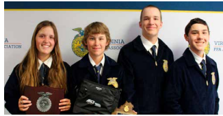
AG MECHANICS - JUNIOR Team: Powhatan