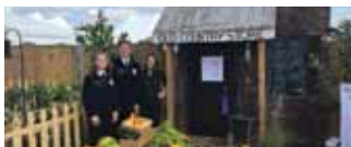
GARDEN State Winner Spotsylvania FFA