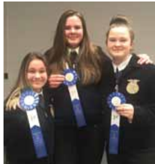
Senior Hippology winning team was from Blacksburg FFA.