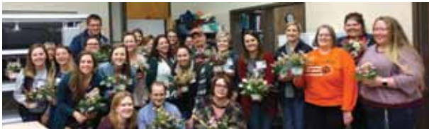
Teachers show off their skills in a floral design workshop.