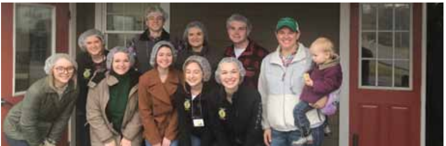
The State Officer Team toured Donald's Meat Processing in Lexington, Virginia.