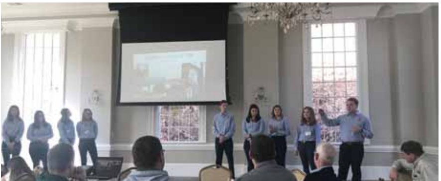
The team gave a presentation on their recent ILSSO trip to Spain and Portugal.