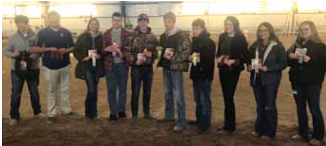
TOP TEN INDIVIDUALS IN THE JUNIOR STOCKMAN'S CONTEST