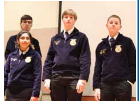
Members anxiously awaited the results of the Creed Speaking contest.