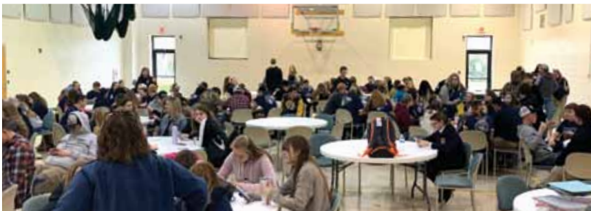
Rally got underway with opening ceremonies and instructions about contests and workshops.