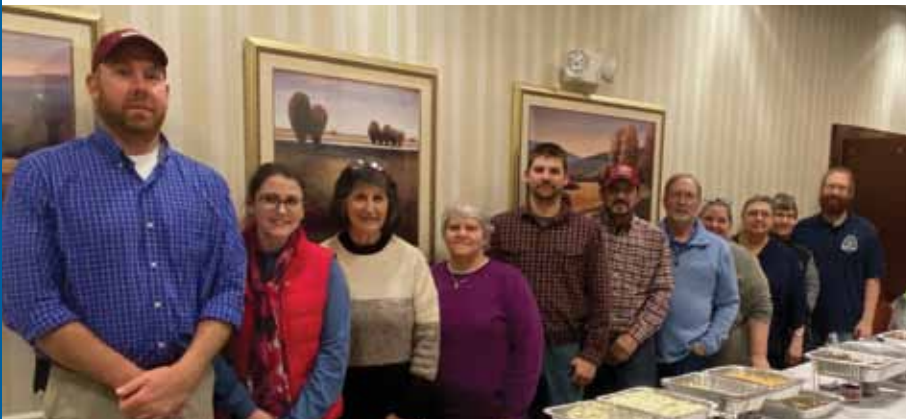
Louisa FFA alumni supported this event by catering delicious meals for the group.