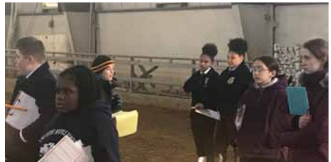
FFA Members gather around the arena to judge a halter class.