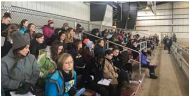
4-H and FFA members were poised to compete in this year’s events.