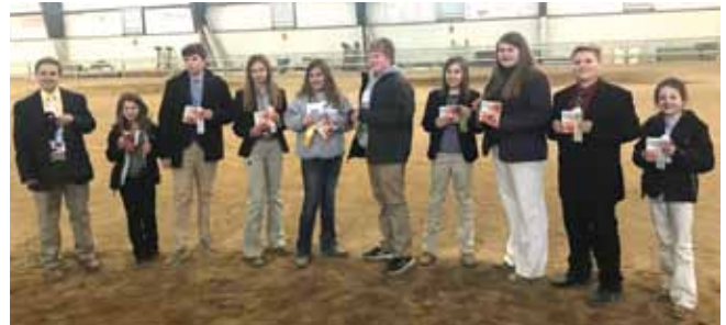
TOP TEN INDIVIDUALS IN THE JUNIOR ADVANCED JUDGING CONTEST