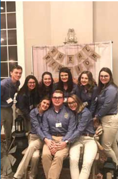
The State Officer Team before dinner.