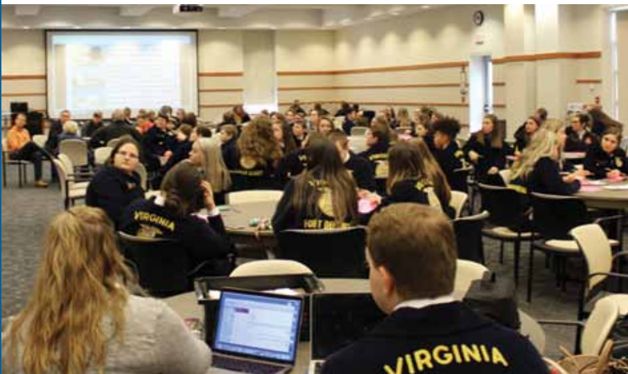
Members gathered in the ballroom to gear up for lunch and Ag Reality Town.