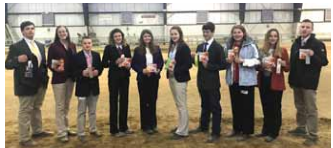
TOP TEN INDIVIDUALS IN THE SENIOR ADVANCED JUDGING CONTEST