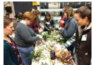
Teachers have the unique opportunity to collaborate with other teachers to gain ideas and knowledge to take back to their classes.