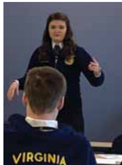
State officers held leadership workshops for members during the rally.