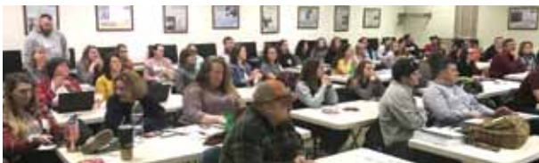
Teachers gather for an update from VAAE leaders during the opening session of the Winter In-Service.

The Virginia Association of Agriculture Educators (VAAE) met on January 28 and 29 for the 2020 VAAE Winter In-Service. The event was held at Valley Career and Technical Center in Fishersville, Virginia. During this time, educators from around the state took part in workshops, sessions, and meetings to help them better serve the students in their own communities. During general sessions, teachers received updates from state leaders and from state colleges and universities. In workshops, teachers participated in sessions that would provide additional resources for their classrooms and learned new skills in the Make-It-Take-It workshops. From sheep production to wind turbines and greenhouse misting benches to shop safety, there was something for every program at this year's in-service. We would like to thank our hosts at VCTC, workshop presenters, and attendees for a successful event.