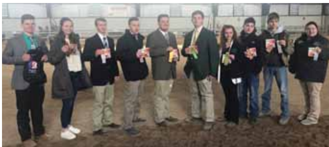
TOP TEN INDIVIDUALS IN THE SENIOR STOCKMAN'S CONTEST