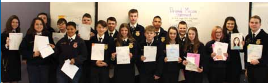
FFA Members showed off their self-portraits, an exercise to help them envision their future selves.