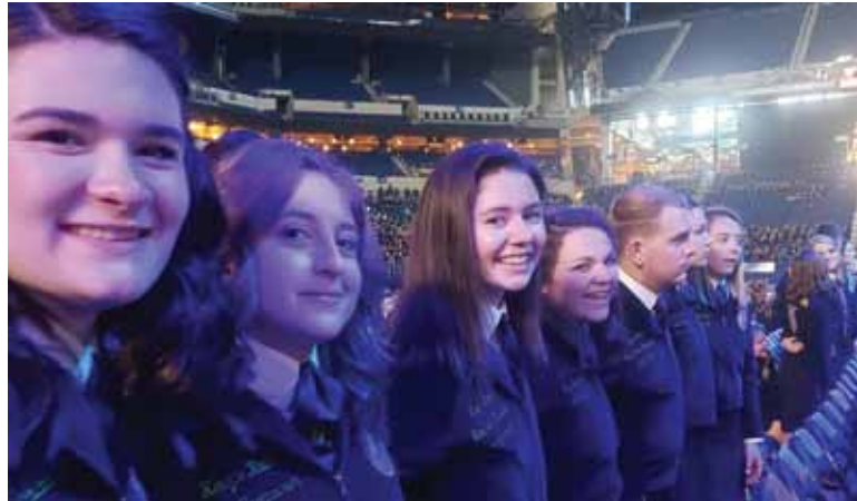
VA FFA State Officers at the 92nd National Convention and Expo.