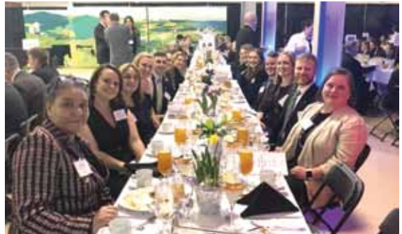
VAAE and FFA Foundation guests pose for a photo during dinner.