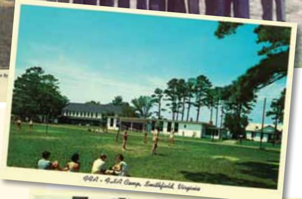
FFA - FFA Camp, Smithfield, Virginia