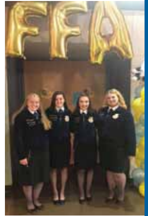
Members learn more about relationships at the Appalachia C.O.L.T.