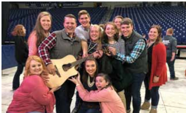
VA FFA State Officers with Garth Brooks' guitar