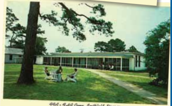
FFA - FFA Camp, Smithfield, Virginia