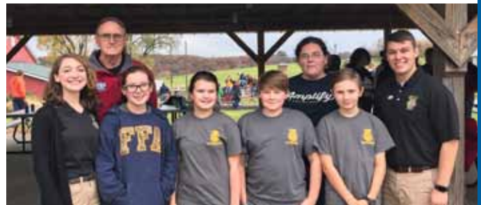
TOP JUNIOR TEAM

The top three junior teams were Broadway (third), Strasburg (second), and Powhatan Middle (state champion). For the overall teams, Holston took third, Strasburg placed second, and James River was the state winning team in the senior competition. The top five teams have the opportunity to represent Virginia at the National Soil and Range competition in Oklahoma in May!