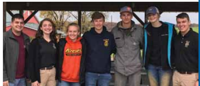
TOP SENIOR TEAM