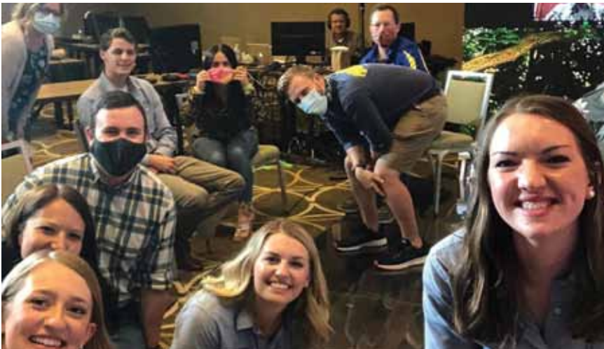
Summit is managed and led by present and past National FFA Officers and National FFA Staff.

State Officer Summit gave our officers the best opportunity to plan how they want to advocate for the upcoming year.