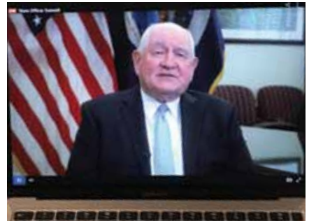
State officers were honored to hear a special address from the U.S. Secretary of Agriculture, Sonny Perdue.