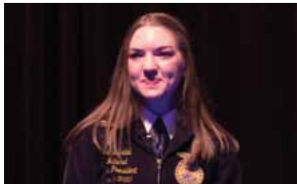
National FFA Eastern Region Vice President, and Virginia FFA Alumni, gives the keynote speech of Session 2.