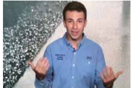
The National Officer team worked diligently to provide a meaningful State Officer Summit experience.