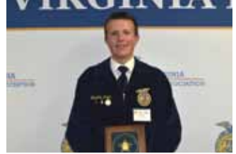
DIVERSIFIED LIVESTOCK PRODUCTION Benjamin Knick Wilson Memorial FFA